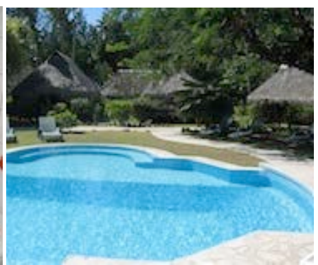
Salt-water pool and garden