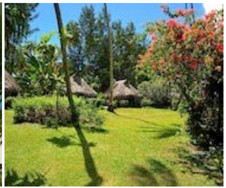
Hotel Hibiscus gardens