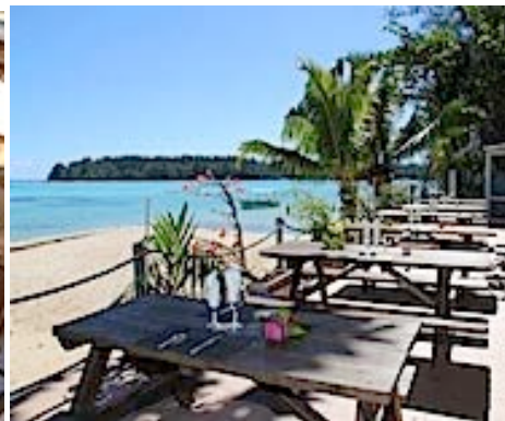
Deck of the Le Sunset