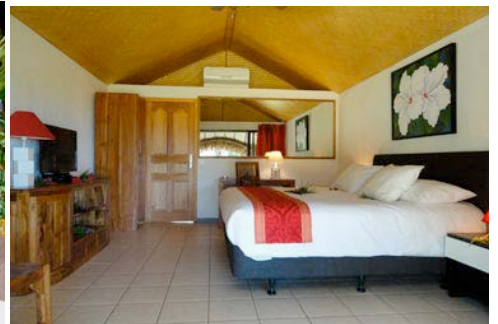
Images of Hotel Hibiscus, Moorea French Polynesia