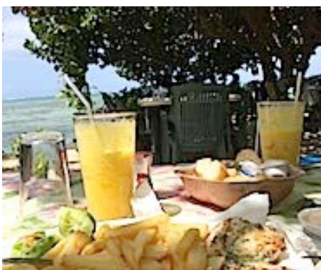
Fresh Mahimahi at Snack Mahana