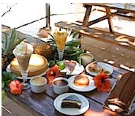
Desserts at Le Sunset