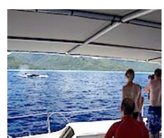
Humpback whale from Cata Manu