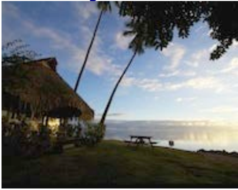
Hotel Hibiscus Superior Lagoon Fare