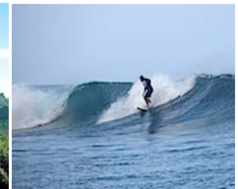
Surfing the Ha'apiti reef