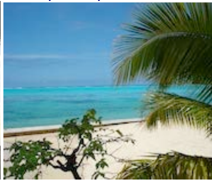
Hotel Hibiscus beach