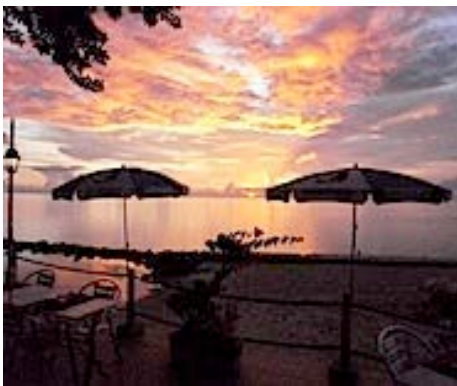
Sunset at the Le Sunset Bar & Restaurant