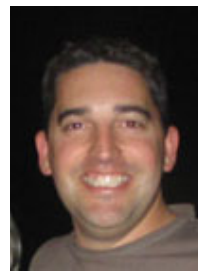
Scott Portelli Photography Guide & Guide