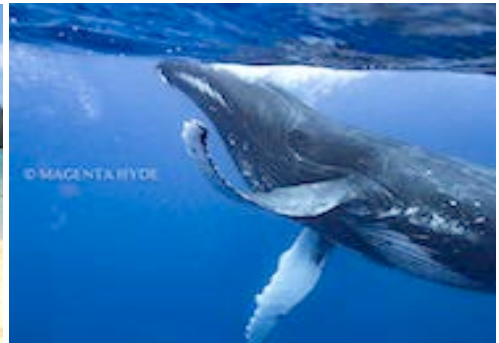
'Cata Manu' and Underwater Humpback Whale photographs taken by Magenta Hyde on Cata Manu