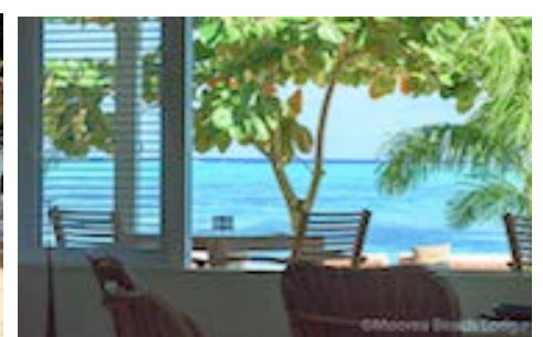
View from Verandah Restaurant