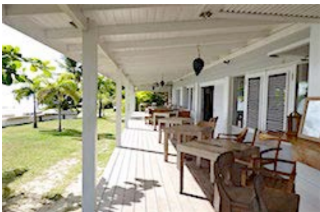
Verandah Restaurant at the Lodge