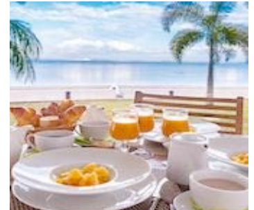
Whale-whisperer - Maire Temau'u – Manu, our boat mascot – Maire & Skipper, Tere'e – Breakfast at the Lodge