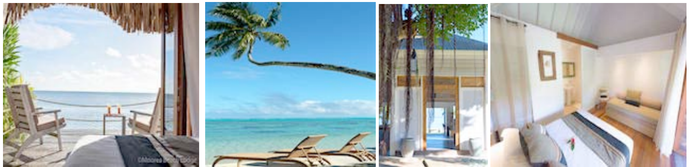
Images of Moorea Beach Lodge, Moorea French Polynesia