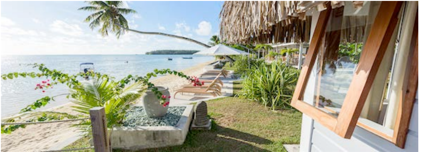
Moorea Beach Lodge