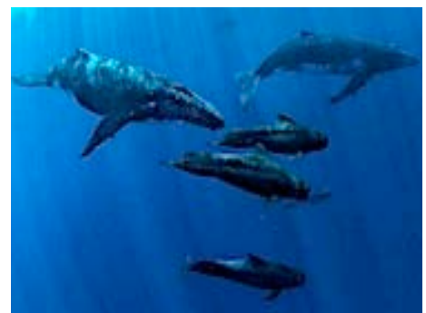
'Cata Manu' and Underwater Humpback Whale photographs