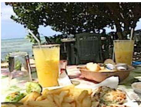
Fresh Mahimahi at Snack Mahana