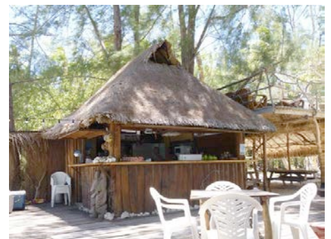
Coco Beach Cafe