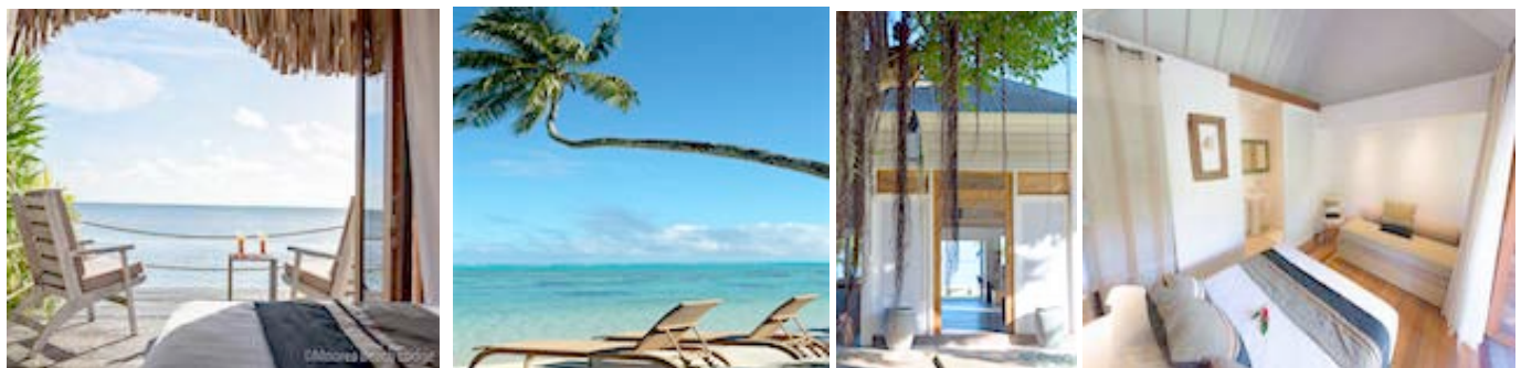
Images of Moorea Beach Lodge, Moorea French Polynesia