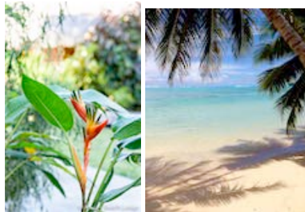
Garden & beach at the Lodge