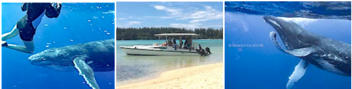
‘Cata Manu’ and Underwater Humpback Whale photographs on Catu Manu