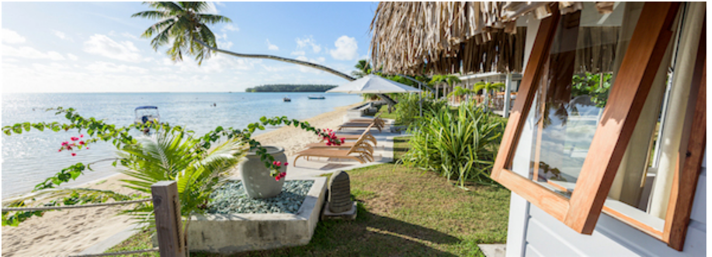
Moorea Beach Lodge