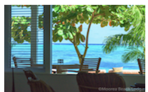
View from Verandah Restaurant