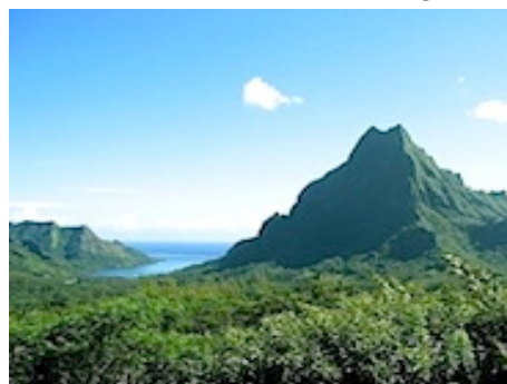
View from the Belvedere