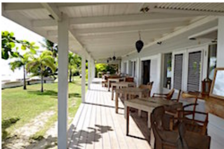
Verandah Restaurant at the Lodge