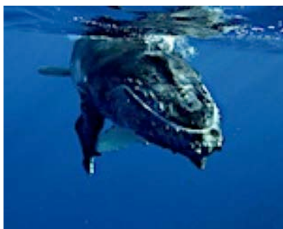
Inquisitive humpback calf