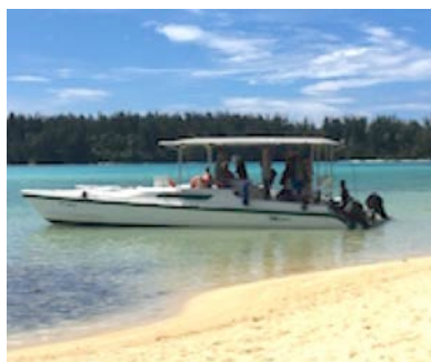
Our whaleswim boat Cata Manu