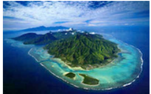
The beautiful island of Moorea