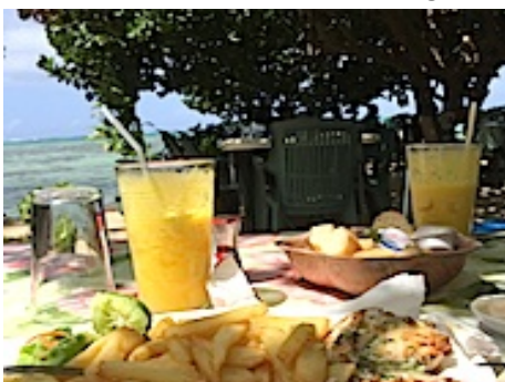
Fresh Mahimahi at Snack Mahana