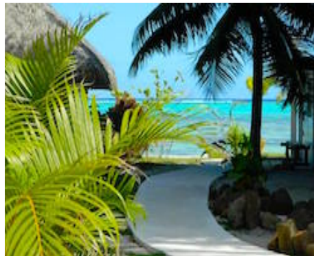
Pathway to beach