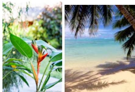
Garden & beach at the Lodge