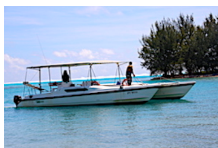
Our boat – Cata Manu