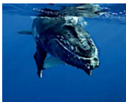
Inquisitive humpback calf