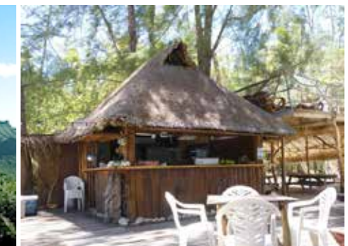
Coco Beach Café