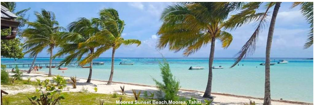
Moorea Sunset Beach, Moorea, Tahiti

All Tours Include: Welcome Dinner, 7 or 9 nights accommodation with breakfast at the beautiful Moorea Sunset Beach in bungalows or suites with en-suite bathrooms, air-conditioning, outdoor verandah with table & chairs. The breakfast cafe is just along the beach overlooking the sparkling turquoise lagoon and our dinner venue is a surprise! Watch the whales over the reef and the exquisite sunsets. Some evening meals are included in the package (with 3 or 4 free evenings to explore the town and its restaurants or attend a traditional Tahitian Feast) and 2 special lunches. You will spend half-days (4 – 5 hours) out on the water on the licensed catamaran 'Cata Manu' and the passionate eco-crew – skipper/guide, (known as the 'whale-whisperer') Maire Te'amuu, who has been taking people to swim with humpbacks and other marine mammals for 18 years and is truly passionate about the protection of the ocean and the environment. Return transfers from the airport or Ferry terminal on Moorea are included.