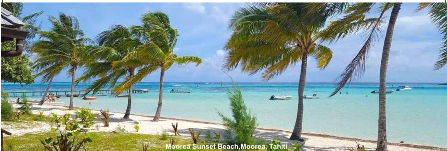
Moorea Sunset Beach, Moorea, Tahiti

All Tours Include: Welcome Dinner, 7 or 9 nights accommodation with breakfast at the beautiful Moorea Sunset Beach in bungalows or suites with en-suite bathrooms, air-conditioning, outdoor verandah with table & chairs. The breakfast cafe is just along the beach overlooking the sparkling turquoise lagoon and our dinner venue is a surprise! Watch the whales over the reef and the exquisite sunsets. Some evening meals are included in the package (with 3 or 4 free evenings to explore the town and its restaurants or attend a traditional Tahitian Feast) and 2 special lunches. You will spend half-days (4 – 5 hours) out on the water on the licensed catamaran 'Cata Manu' and the passionate eco-crew – skipper/guide, (known as the 'whale-whisperer') Maire Te'mau'u, who has been taking people to swim with humpbacks and other marine mammals for 18 years and is truly passionate about the protection of the ocean